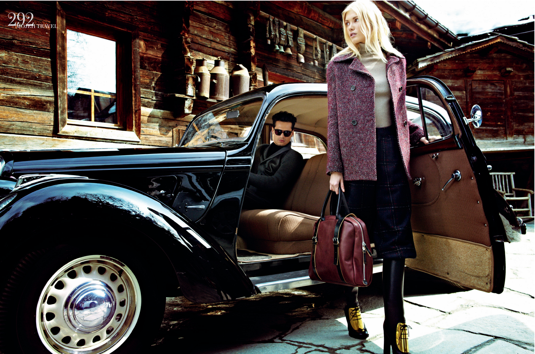
Enough To Last The Winter, MOJEH Issue 16