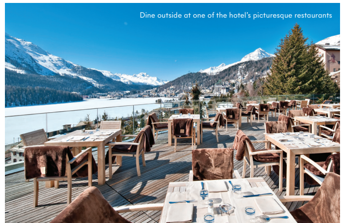
Dine outside at one of the hotel's picturesque restaurants