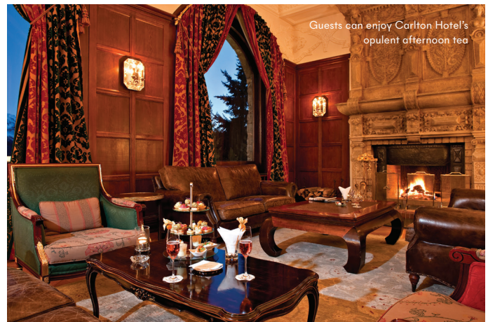
Guests can enjoy Carlton Hotel's opulent afternoon tea