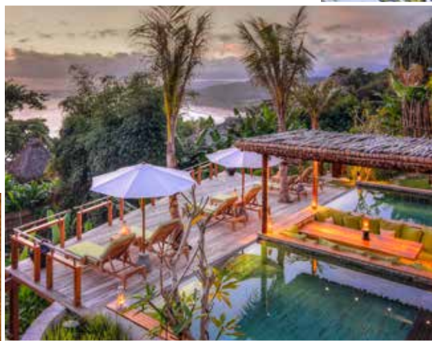
Right: Sunset from the pool at Puncak villas Bottom: Inside the serene bedroom of the new Mamole Tree House hotel