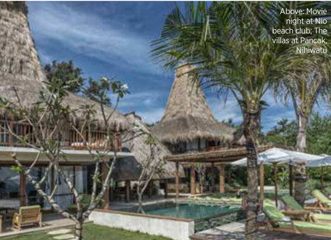
Above: Movie night at Nio beach club; The villas at Pancak, Nihiwatu

FUN IS A SHORE THING While Nihiwatu is famous for its "God's Left" wave, coveted by surfers, it boasts many different waves for both beginners and pros. Let staff know you are a surfer as the resort hosts a maximum of ten a day. For a serene morning, drive or gallop through the countryside to Nihi Oka Safari Spa, set on the beautiful shores of Sumba. There are plans to extend the Safari Spa, with larger facilities and more beauty treatments and massages available.