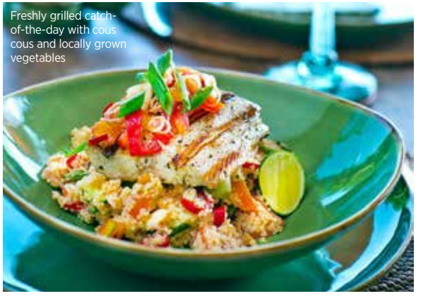
Freshly grilled catch-of-the-day with cous-cous and locally grown vegetables

The roof of the Mandaka villa is the distinct high-peaked alang-alang grass thatched roof, seen peeping throughout the Sumbanese landscape. It pitches high into the sky as the Sumbanese believe that the spirits of ancestors, Marapu, reside in the peak, on top of a sloping wider rim. At the highest point of the roof, the four-poster structure is divided right and left. The front right-side has a masculine balance and is reserved for