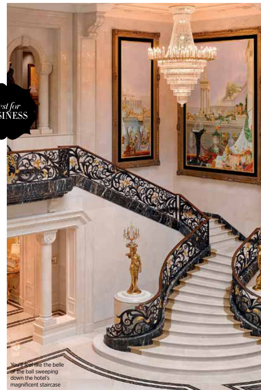
You'll like the belle of the ball sweeping down the hotel's magnificent staircase

Rooms start from Dhs710. Starwoodhotels.com