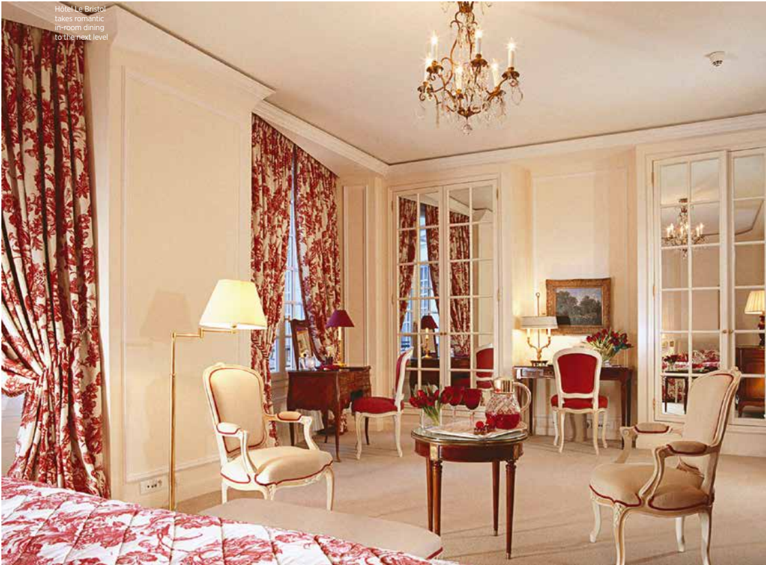
Hôtel Le Bristol takes romantic in-room dining to the next level