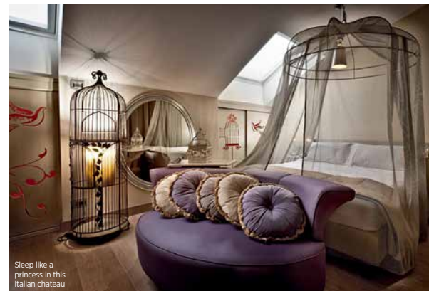
Sleep like a princess in this Italian chateau