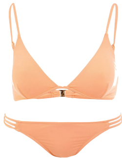
1. Bali Bikini, Dhs930, Sand Dollar Dubai