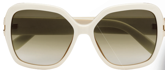
2. Sunglasses, Dhs1,690, Salvatore Ferragamo