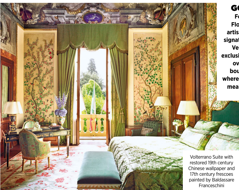
Volterrano Suite with restored 19th century Chinese wallpaper and 17th century frescoes painted by Baldassare Franceschini