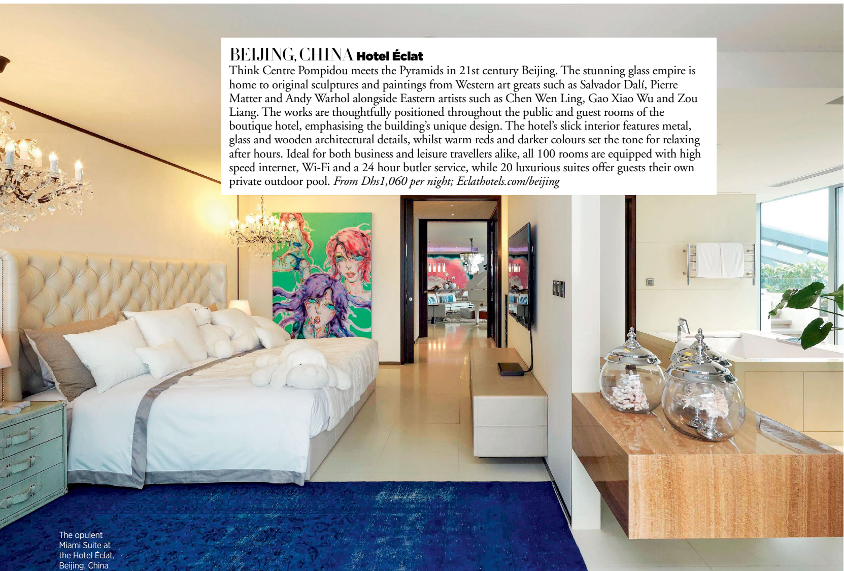
The opulent Miami Suite at the Hotel Éclat, Beijing, China