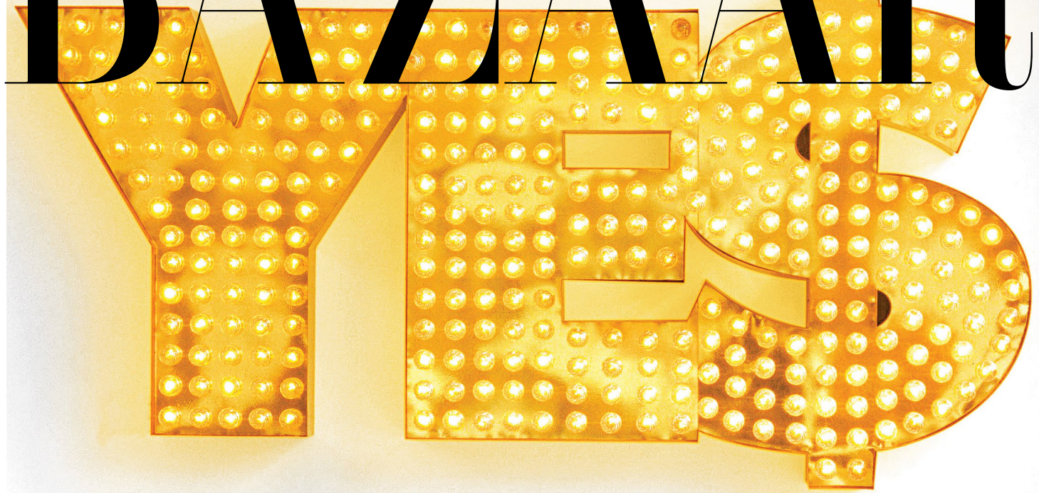
YES sign by artists Tim Noble and Sue Webster at the Semiramis hotel, Athens