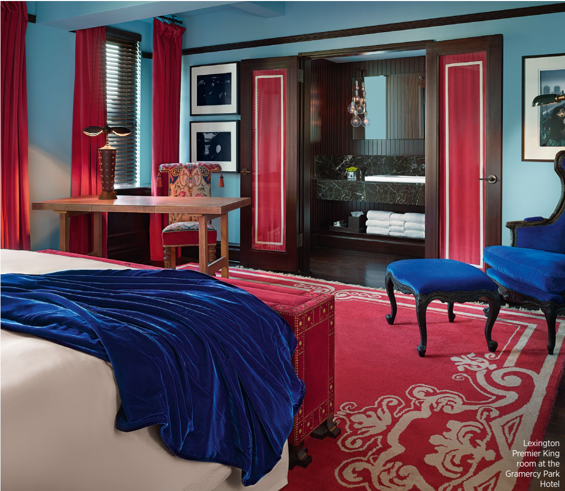
Lexington Premier King room at the Gramercy Park Hotel