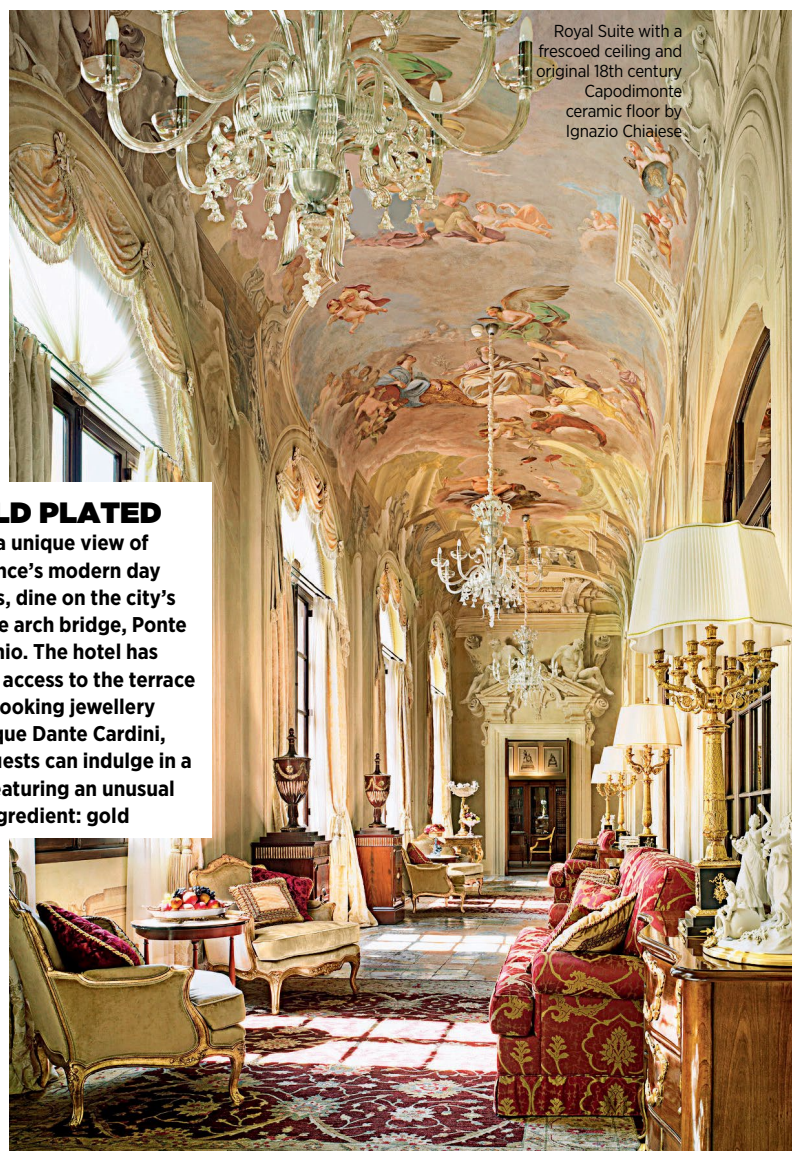
Royal Suite with a frescoed ceiling and original 18th century Capodimonte ceramic floor by Ignazio Chiavese

Harking back to Florence's former glory, this luxury hotel on the edge of the city offers guests the rare opportunity to view historical artworks in their original context. Frescoes, bas-reliefs, stuccoes and silk wallpapers have been carefully restored to their original beauty after years of painstaking restoration. Occupying two restored Renaissance buildings - a 15th century palazzo and a 16th century convent - set within one of the largest Florentine gardens, the hotel's 116 bedrooms are highly decorated in warm Tuscan yellows and greens. One of the most impressive rooms is the Volterrano suite; the 19th century Chinese wallpaper depicting a scenic panorama of trailing flowers and exotic birds is a rare example of the nobility's historical fascination with all things Oriental. The Four Seasons is also home to Florence's only in-hotel spa, which uses the evocative Santa Maria Novella products, with formulas dating to the 13th century. From Dhs2,280 per night; Fourseasons.com/Florence